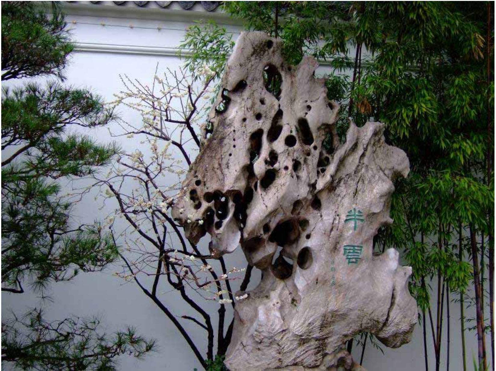
A: Lake Tai Rock in Entry Courtyard