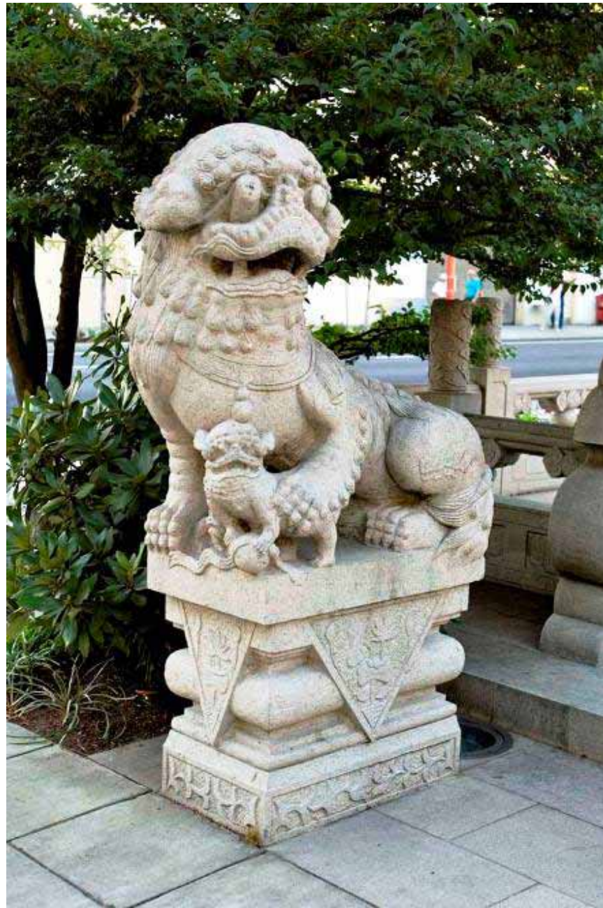
A: Guardian Lion Protector—Stone Gate