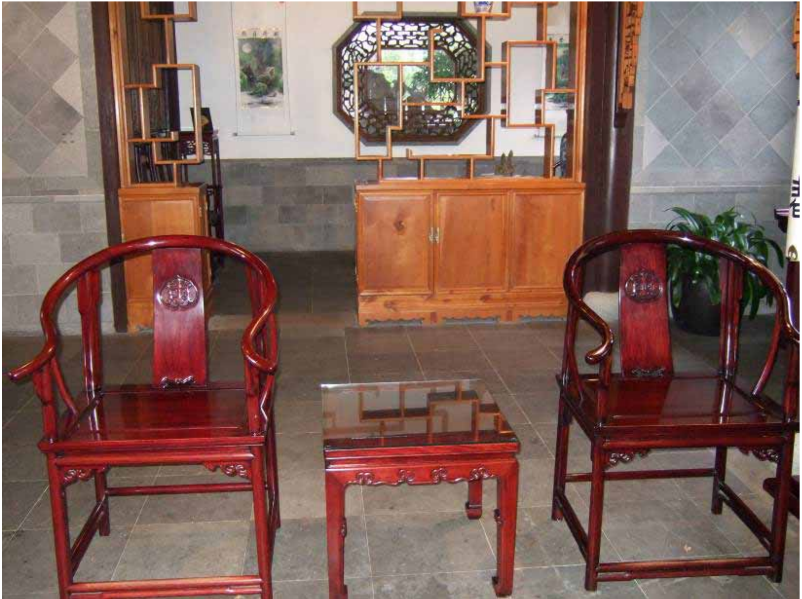
E: Chairs in Scholar's Study—Ming Dynasty style