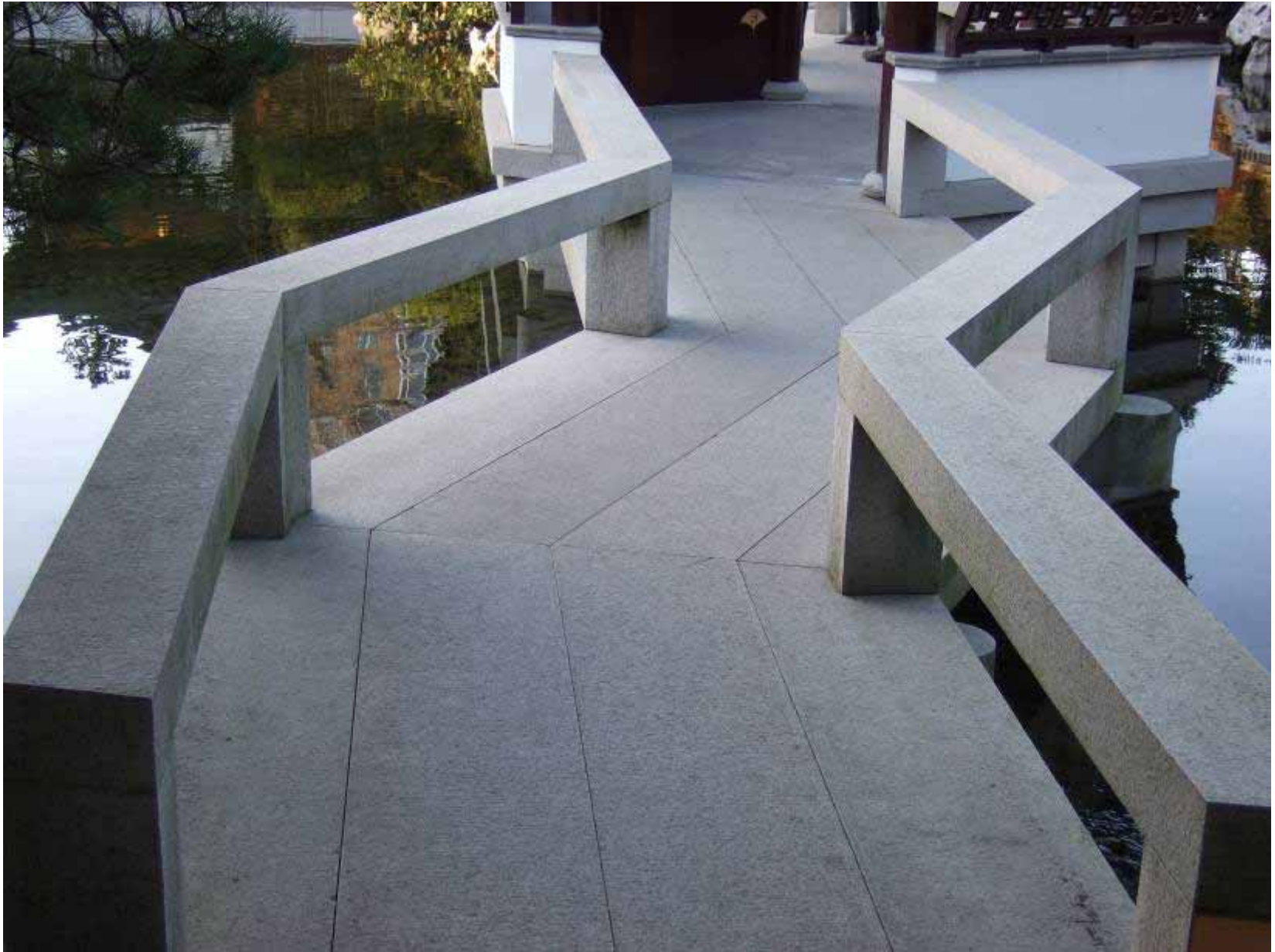
F: Zig-Zag Bridge over Zither Lake