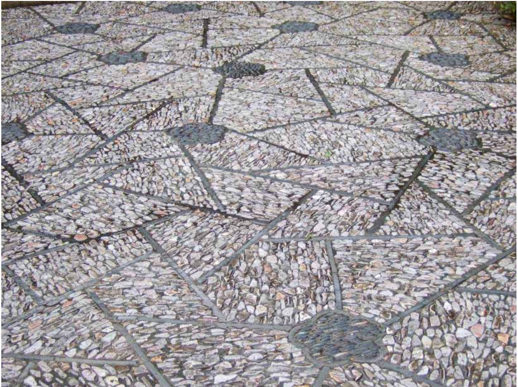
E: Plum Blossom on Cracked Ice—Scholar Courtyard