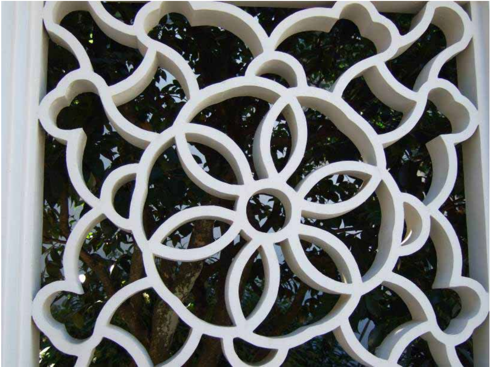
K: Leak Window Fragrance Courtyard