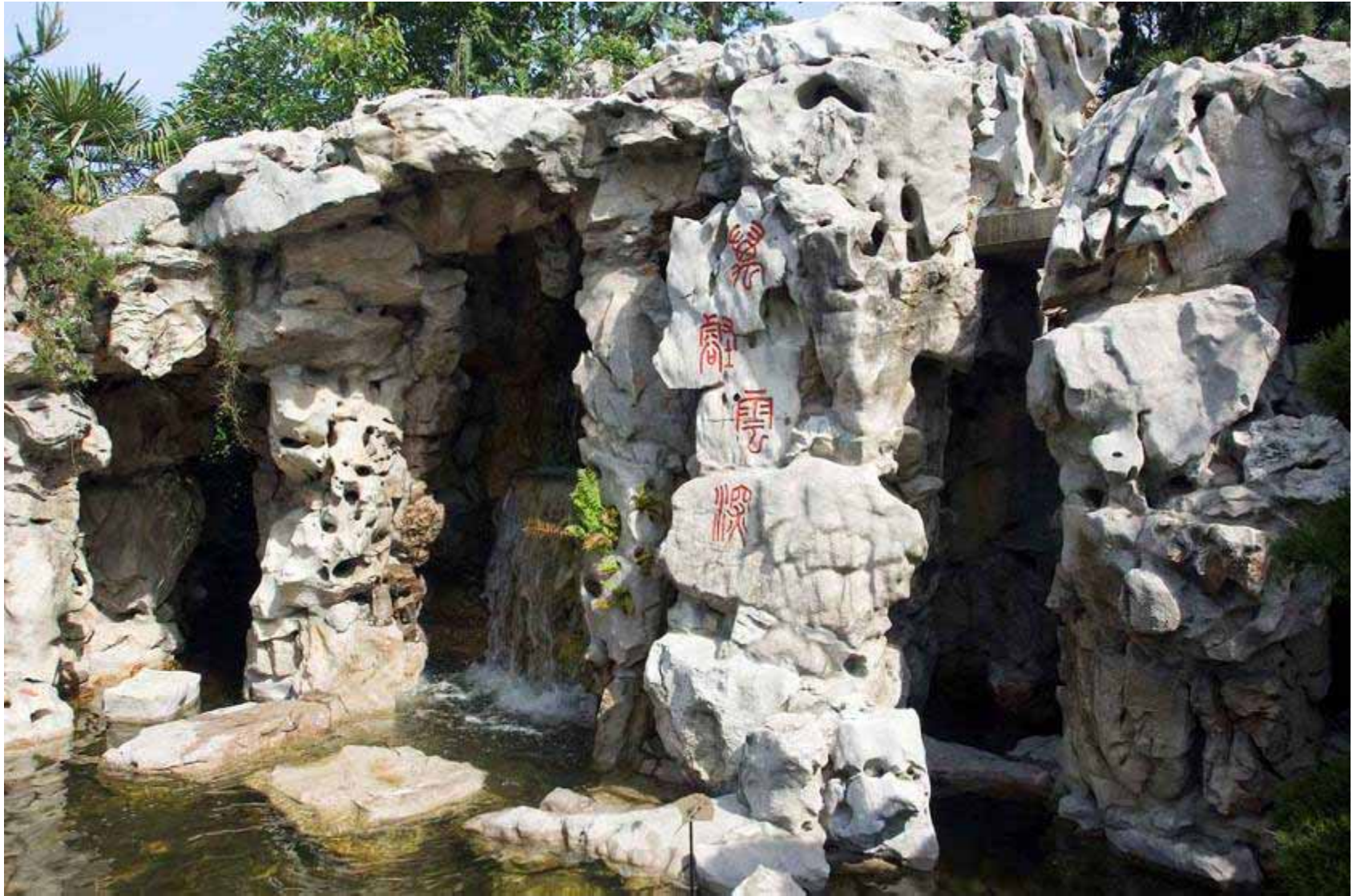
Chinese Inscription on Rock Mountain: 10,000 Ravines Covered in Deep Clouds