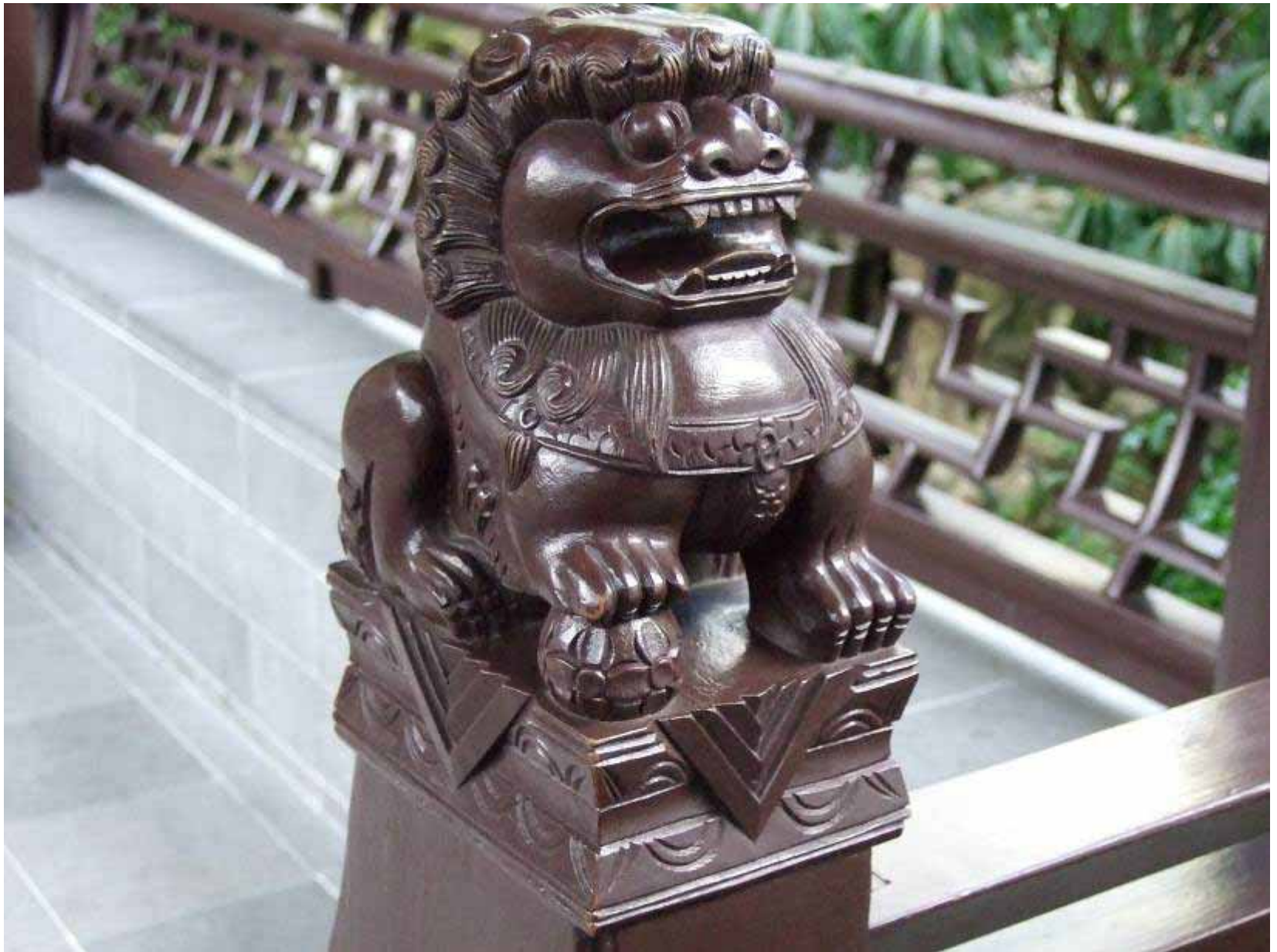
C: Guardian Lion at Knowing the Fish Pavilion