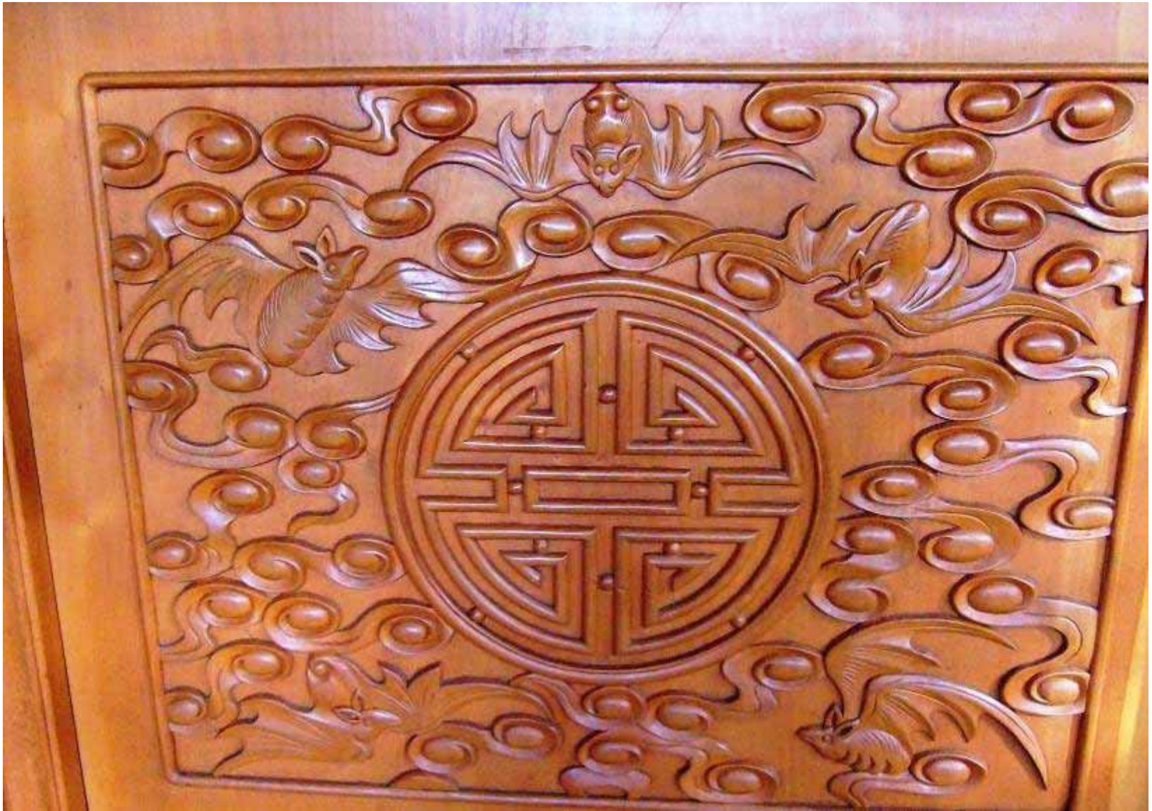
I: Five Bats Flying among Clouds carving in Boathouse