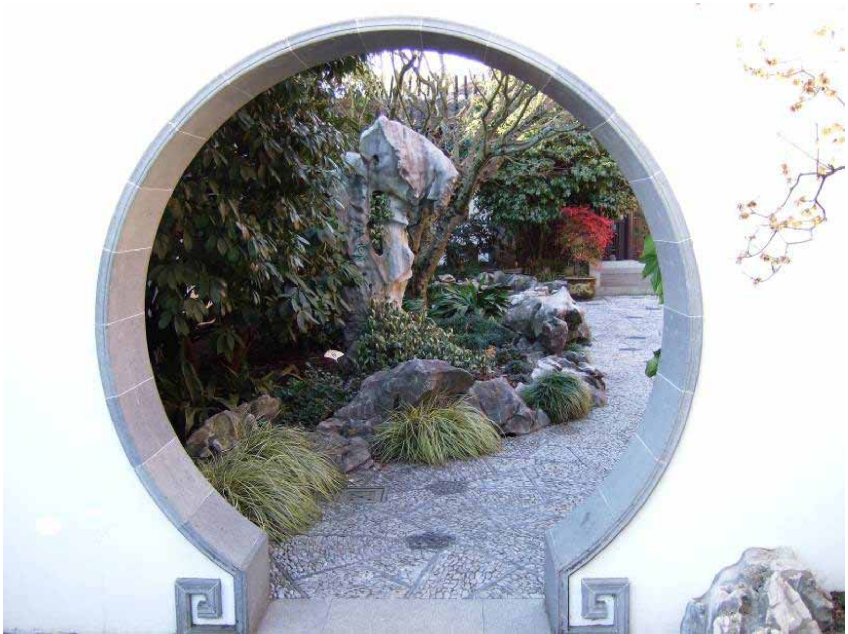
K: Moon Gate in the Fragrance Courtyard