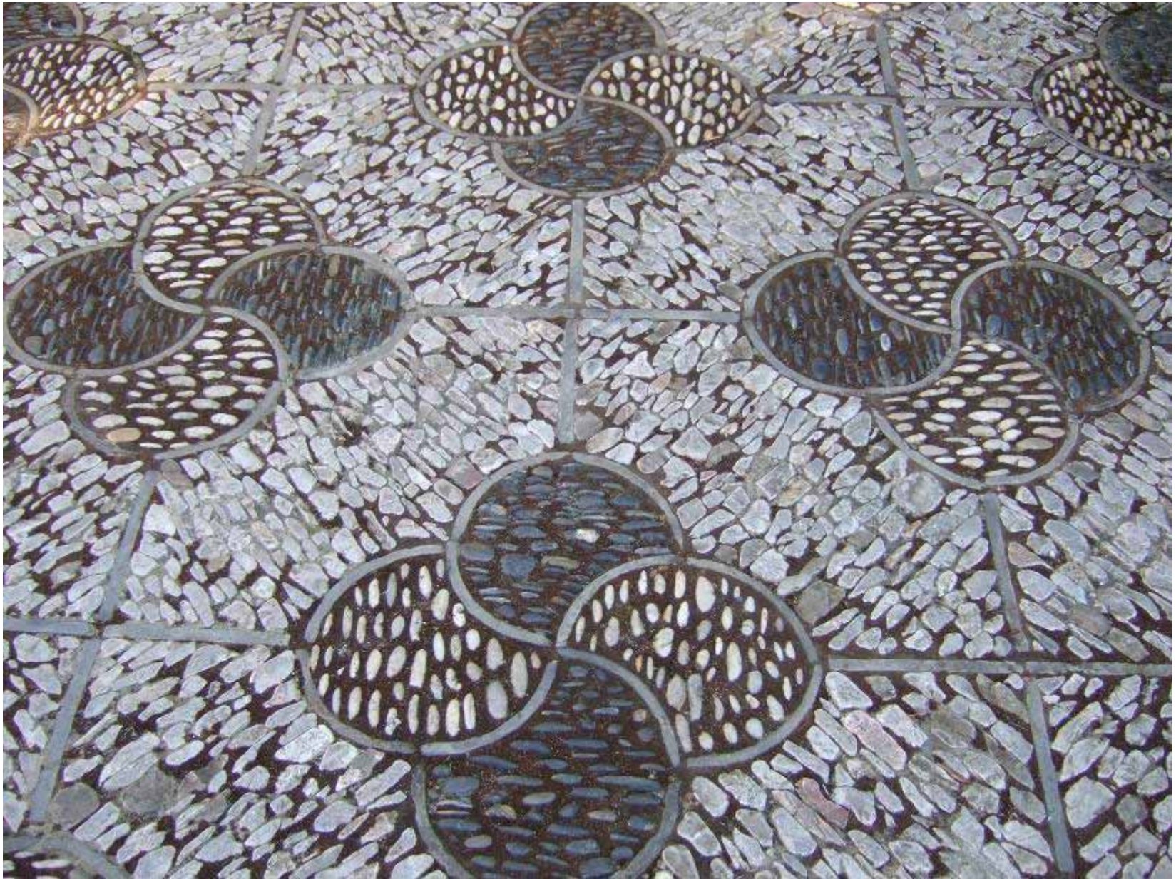
B: Crabapple Mosaic in Tranquility Courtyard