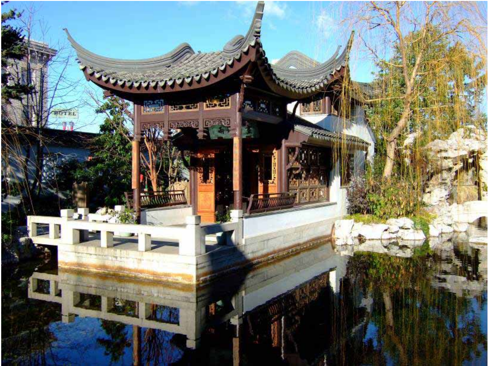
I: Painted Boat in Misty Rain Pavilion