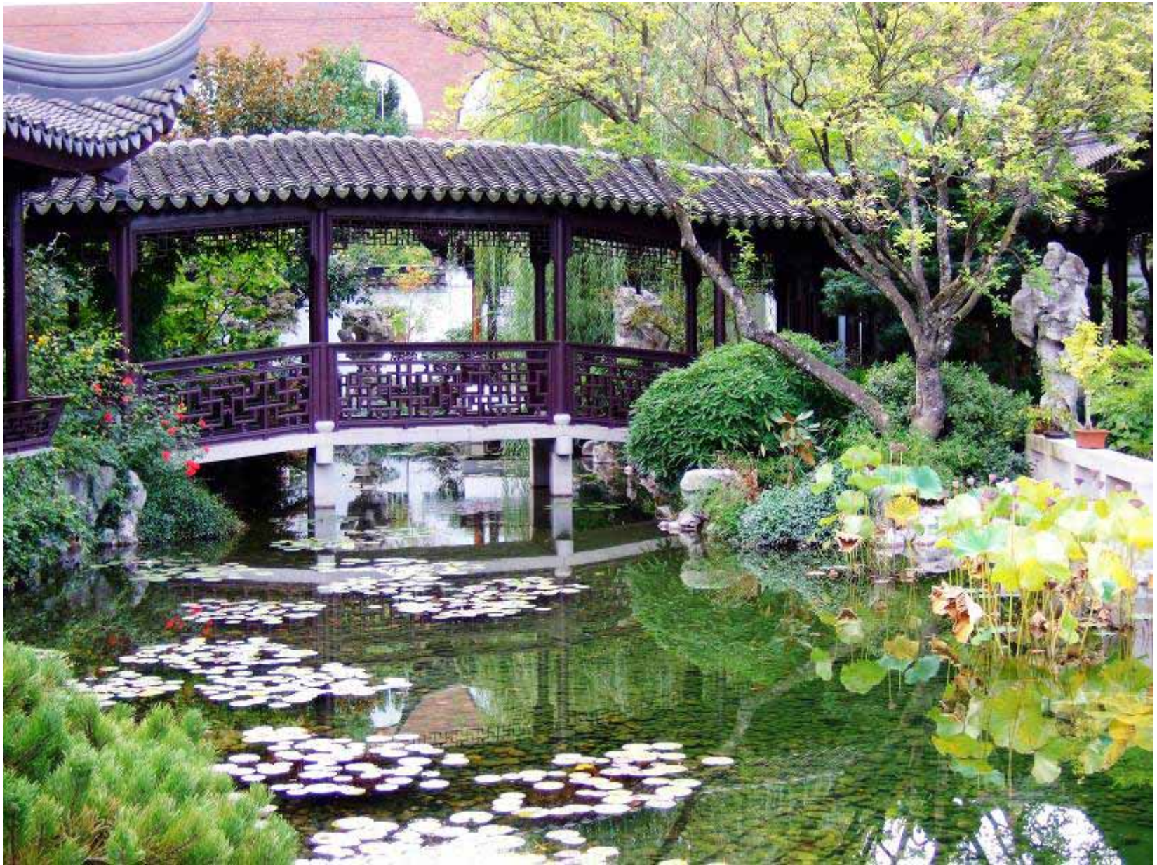
Double Rainbows Resting in the Clouds Bridge