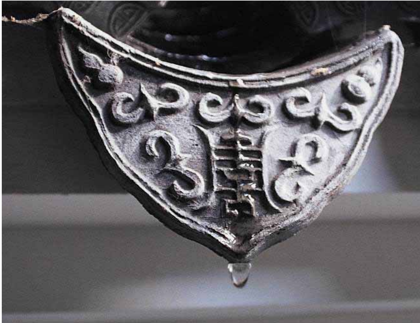
K: Bat-shaped Drip Tile with 5 bats inside