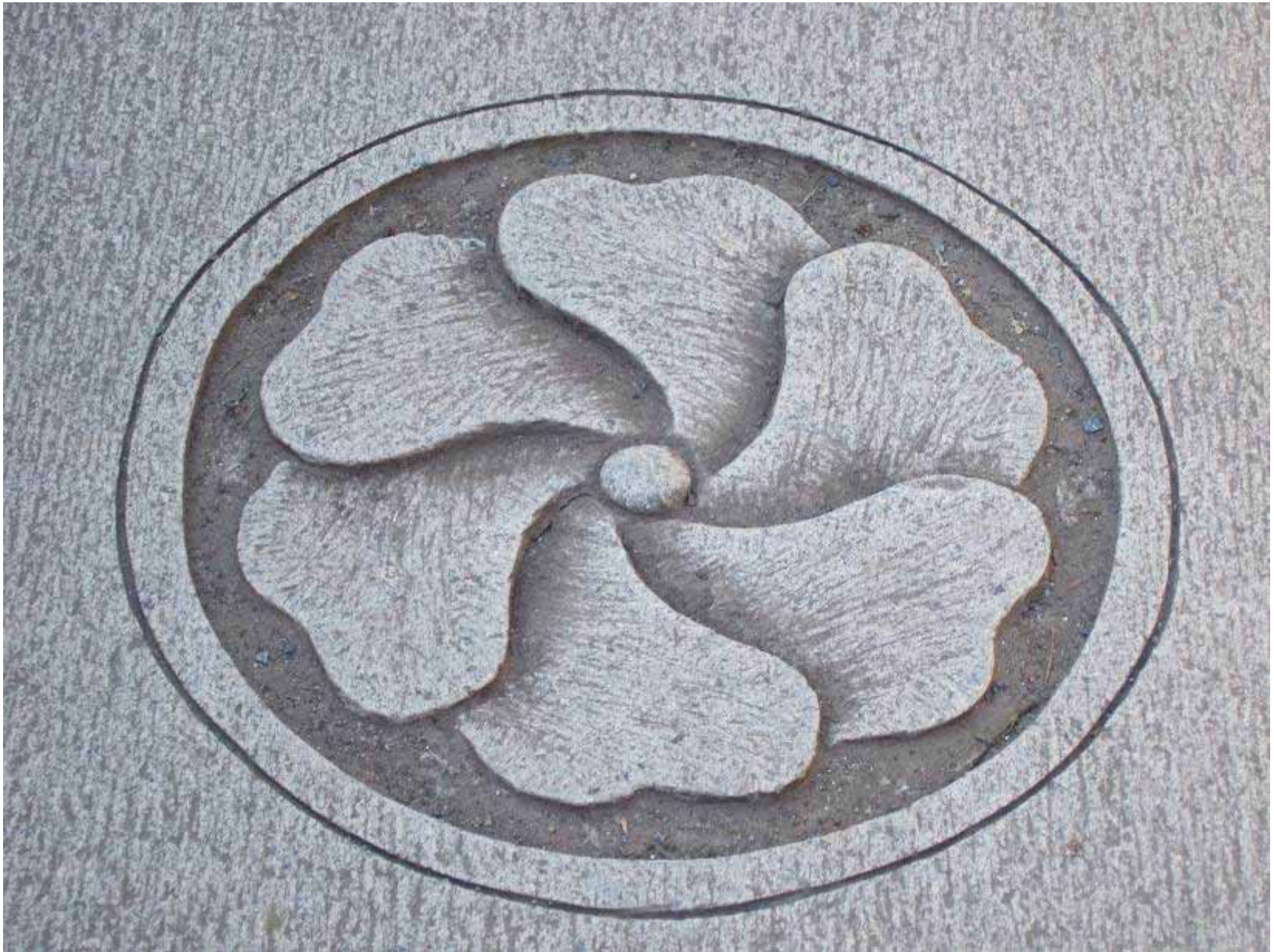
Flower Pattern on bridge by waterfall