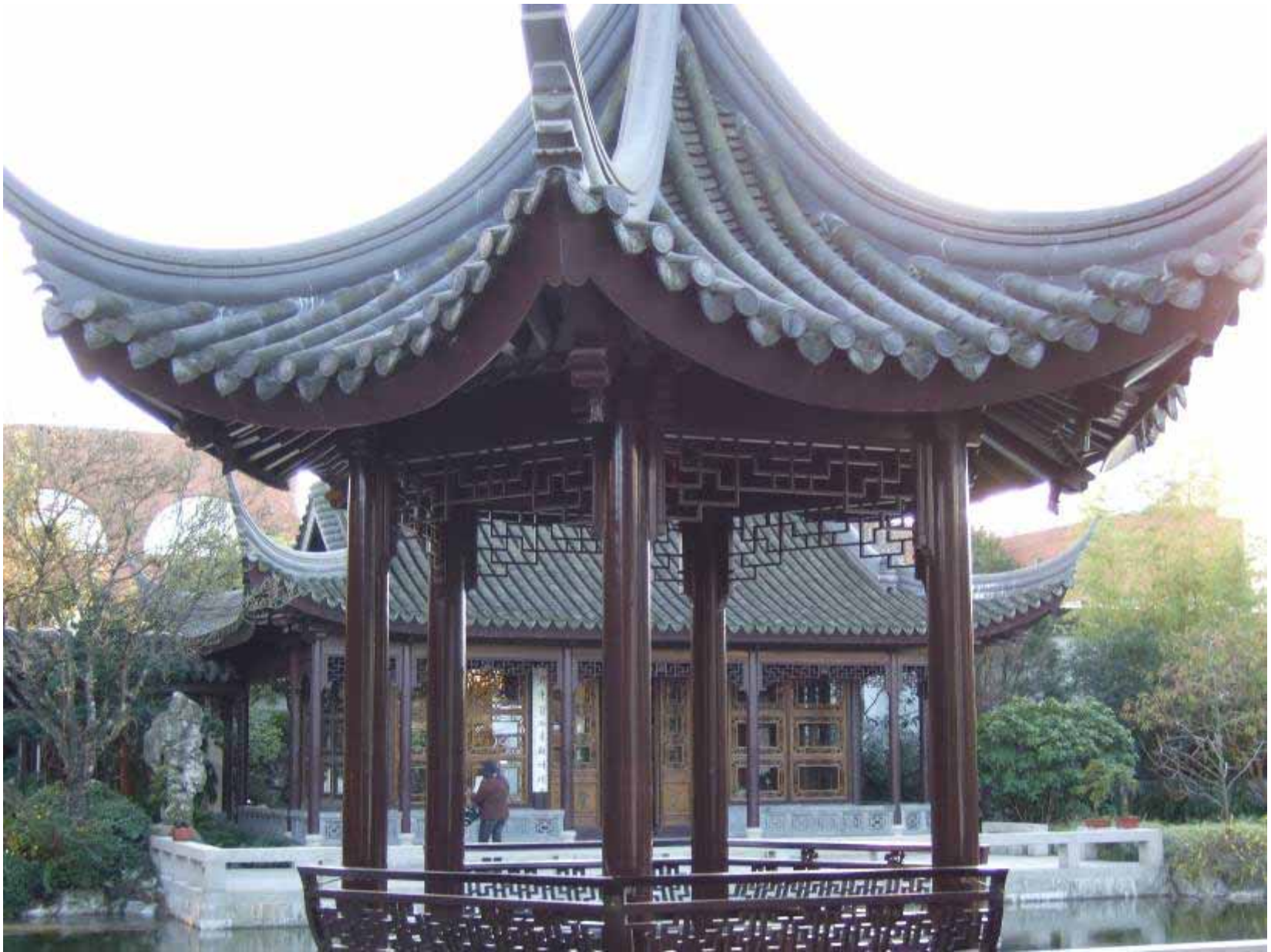
F: Chinese Roof Moon-Locking Pavilion