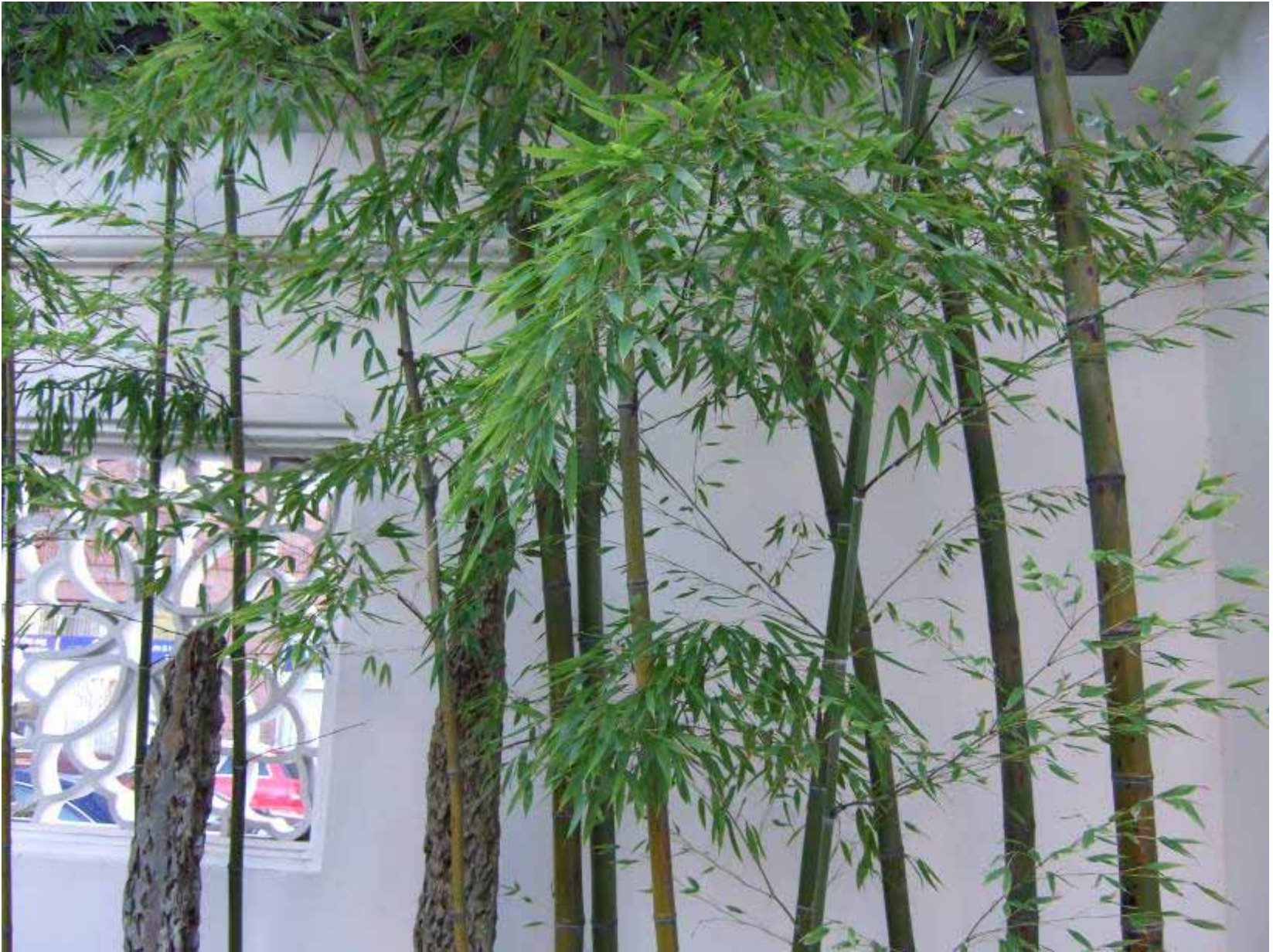
C: Bamboo & Bamboo Stones (by Knowing the Fish Pavilion)